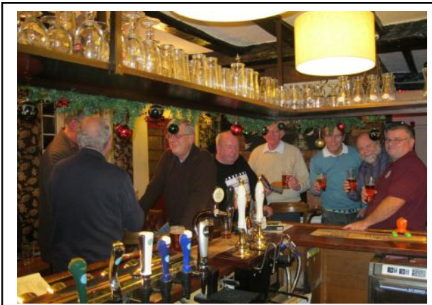
A publicans eye view of a fine body of Real Ale Drinkers. Taken over the Christmas period (the dangling balls are the giveaway!) at the Blacksmiths Arms Little Clacton. How many CAMRA members can you put a name too?