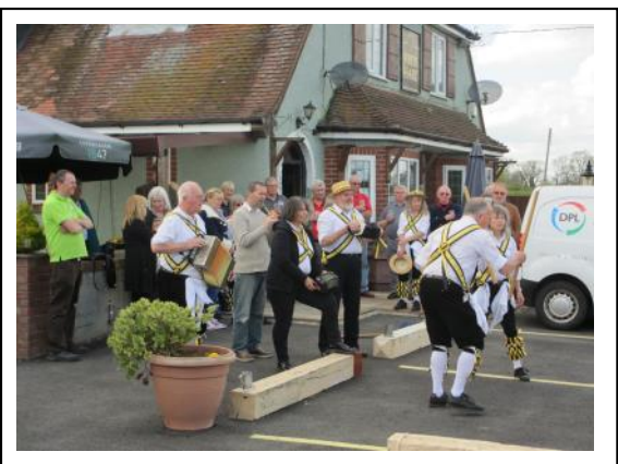
Photograph taken outside the White Hart, Weeley Heath during our 'Morris Traveller'