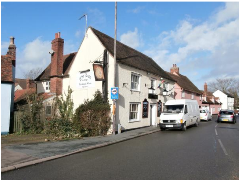
The Lion on 8th February 2014