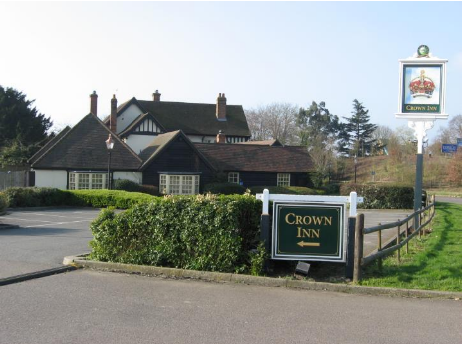
The Crown, Ardleigh

Other websites suggest the pub may date back to the 1500s. If it isn't listed then it is likely that it has been so much altered so often over the centuries that there is nothing deemed worthy of listing.