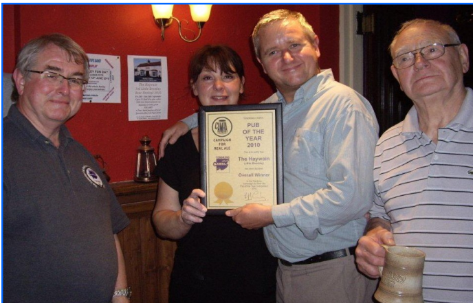
Thanks Haywain for hosting a great Tendring Branch AGM and congratulations on becoming the Tendring POTY for 2010

Chelmsford Beer Fest, 13-17 July Sherringham Beer Fest, 16-18 July Margretting Tye, White Hart, 22-25 July Harwich Town Brewery Fest, 29-31 July Bishops Stortford Beer Festival, 29-31 July Woodbridge, Ye Olde Bell & Steelyard Beer and Cheese Fest, 30 July-2 August GBBF 3-7 August Ale and Wail Fest, The Beer House, Ipswich, raising money for EACH Little Green, Compasses, Beer Festival 20-22 August Peterborough Beer Festival, 24-28 August Clacton Beer Festival, 25-28 August Dove Beer Festival 1-5 Sept St Ives Booze on the Ouse, 16-18 Sept Haywain Beer Fest, 24, 25, 26 Sept Ipswich Beer Festival, 6-9 October Norwich Beer Festival 25-30 October Sawbridgeworth Beer Fest, 29-30 October Rochford Beer Festival 23-27 November Dove Beer Festival 24-28 November Harwich Beer Festival, 1-4 December