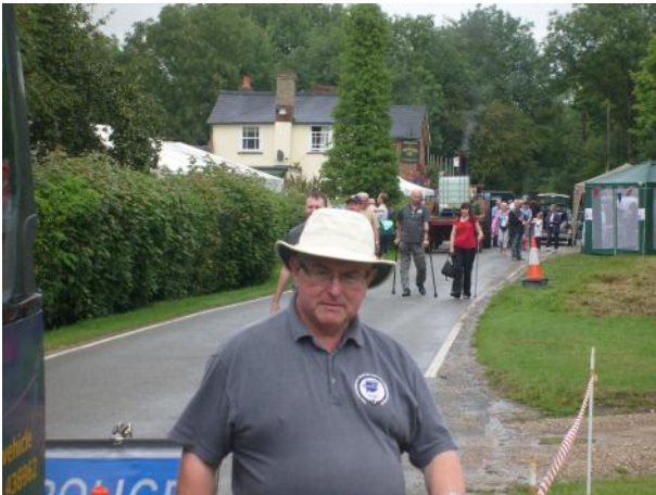
The Little Green Trip . The Branch 'Enforcer' !!