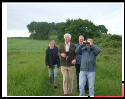
The Apple Tree may be lost but it's 'Beer Club' lives on. Now where was that 'Bloody' Pub? Can you name the guy with the binoculars?