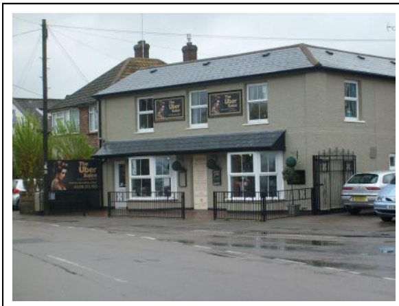
Can you name this now closed pub in our patch? The second pub featured in the same village. This was an Ale House from at least 1862 and closed in the early 1980's.

Clue- Quite a juxtaposition for this building which still has the same name as the old pub. It was very much a 'man's' pub, now it is a Beauty Parlour. Many a previous Landlord would roll their eyes because no 'Actresses or Princess' frequented the pub in their day!